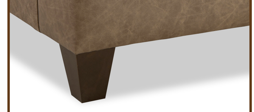
2 Tapered Leg