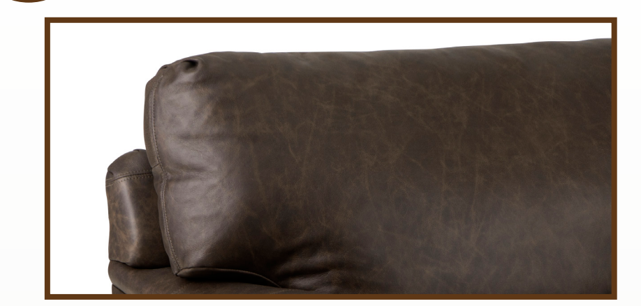
1 Semi-Attached Knife Edge Back