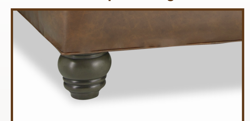
3 Turned Leg