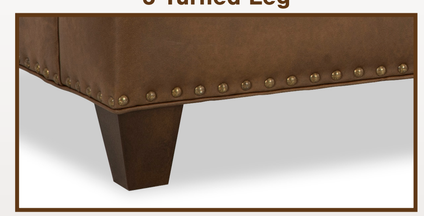
4 Tapered Leg w/ Nails