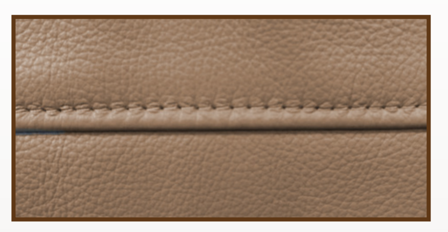
2 French Seam/Single Needle