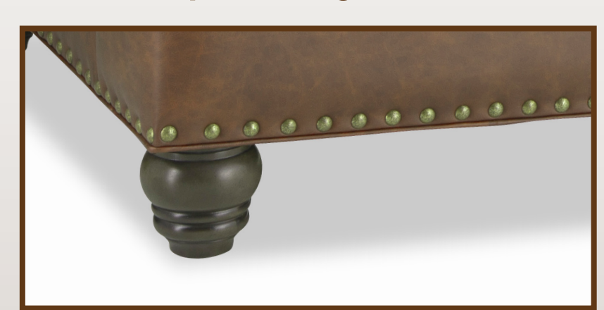
5 Turned Leg w/ Nails