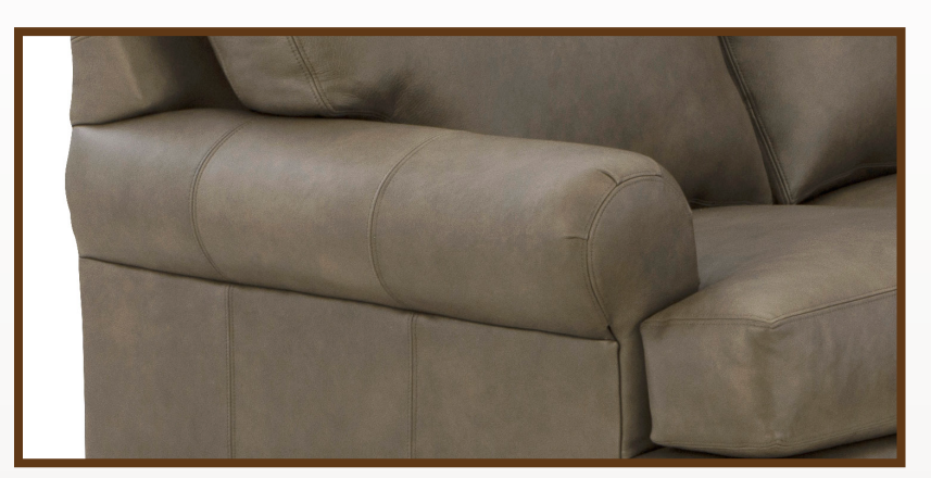
2 Sock Arm