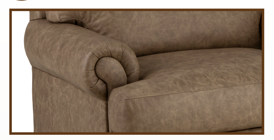
1 Panel Arm