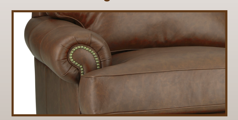
6 Panel Arm w/ Nails